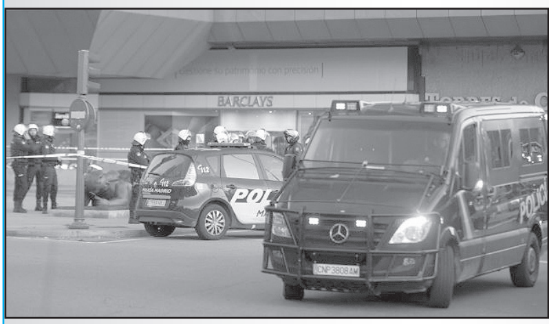
Spanish police block the entrance of Genova Street close to the Spanish headquarters in Madrid, December 19, 2014.

MADRID (PRESS TV) - A Spanish man with serious financial difficulties has been arrested after allegedly driving a car containing gas cylinders into the headquarters of Spain's ruling People's Party.