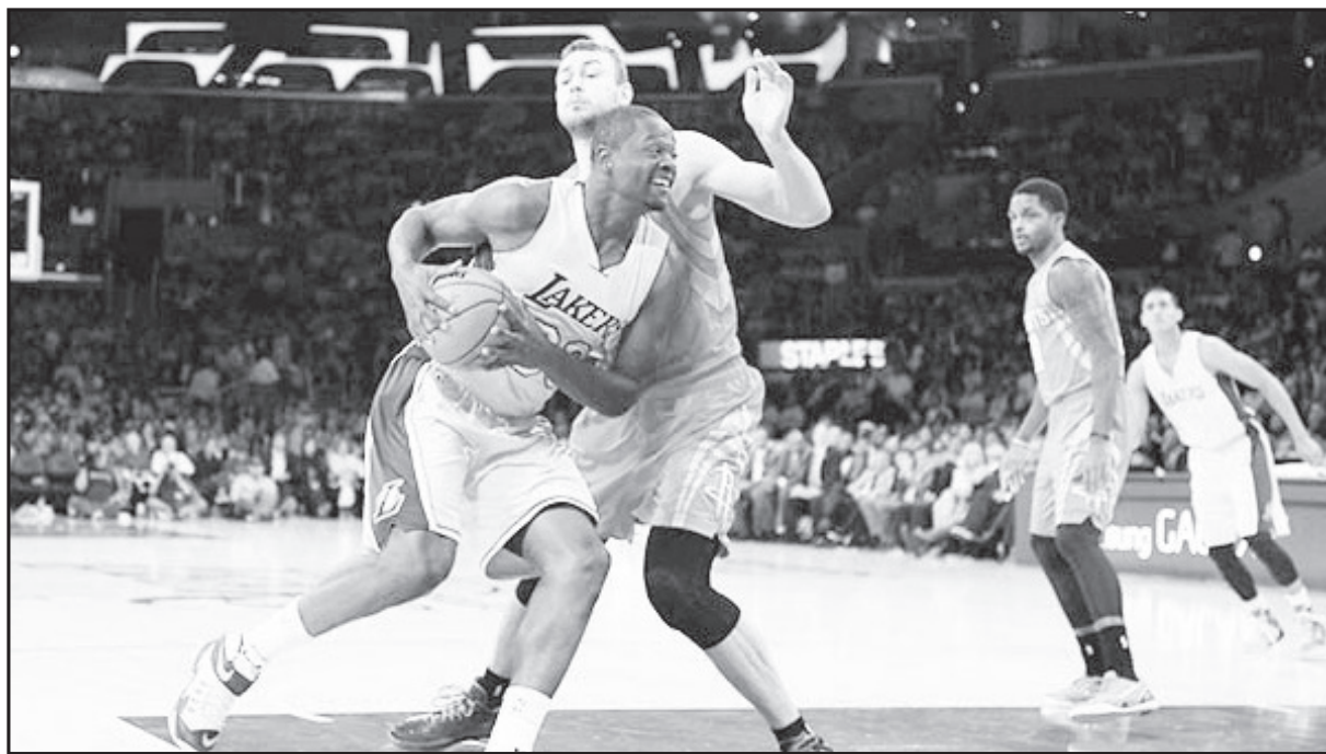
Los Angeles Lakers forward Julius Randle (30) drives against Houston Rockets forward Donatas Motiejunas (20) during the second half at Staples Center in Los Angeles, Oct 28, 2014.

The Lakers have been already without their veteran guard Steve Nash, who is expected to miss the entire season and possibly end his career for back problems.