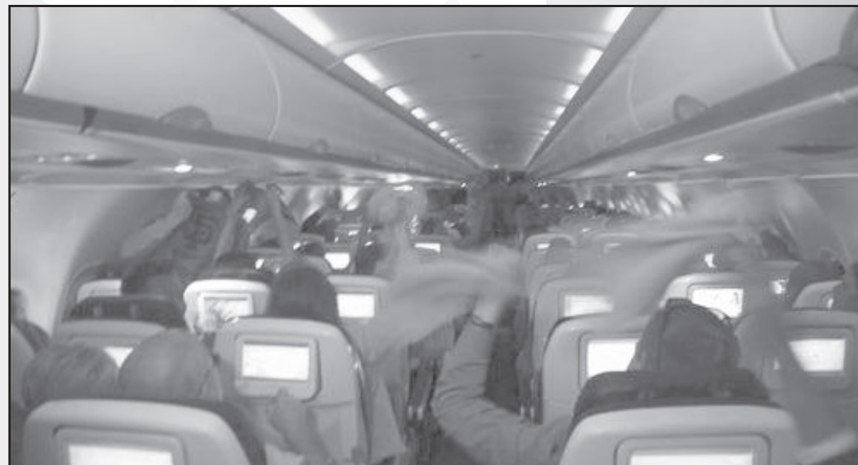
What was louder: the engine or the cheers? Passengers on board this SF-based Virgin America flight celebrated the Giants' World Series victory.

Virgin America, which is based in San Francisco and is the Giants' official airline, did its part to send good vibes to the home team the night of the big game. Flight VX717 began with some Giants trivia. And the flight crew handed out orange rally flags to the passengers.