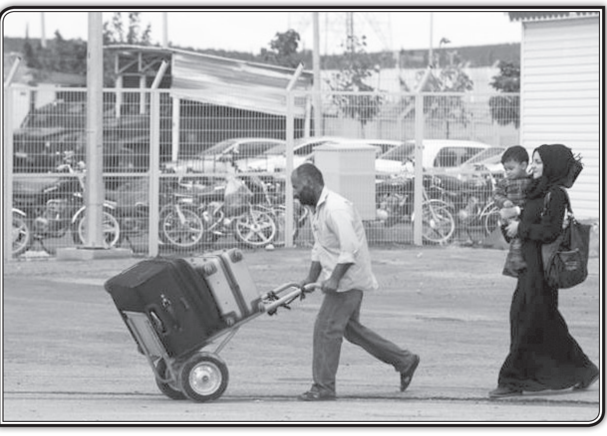
Syrians walk to the Turkish border crossing of Oncupinar, Kilis.

ONCUPINAR, Turkey (Dispatches) -- The Turkish border crossing of Oncupinar, an hour's drive from the embattled Syrian city of Aleppo, is a chaotic buzz of people waiting to pass into one of the most violent regions in the world. Border guards