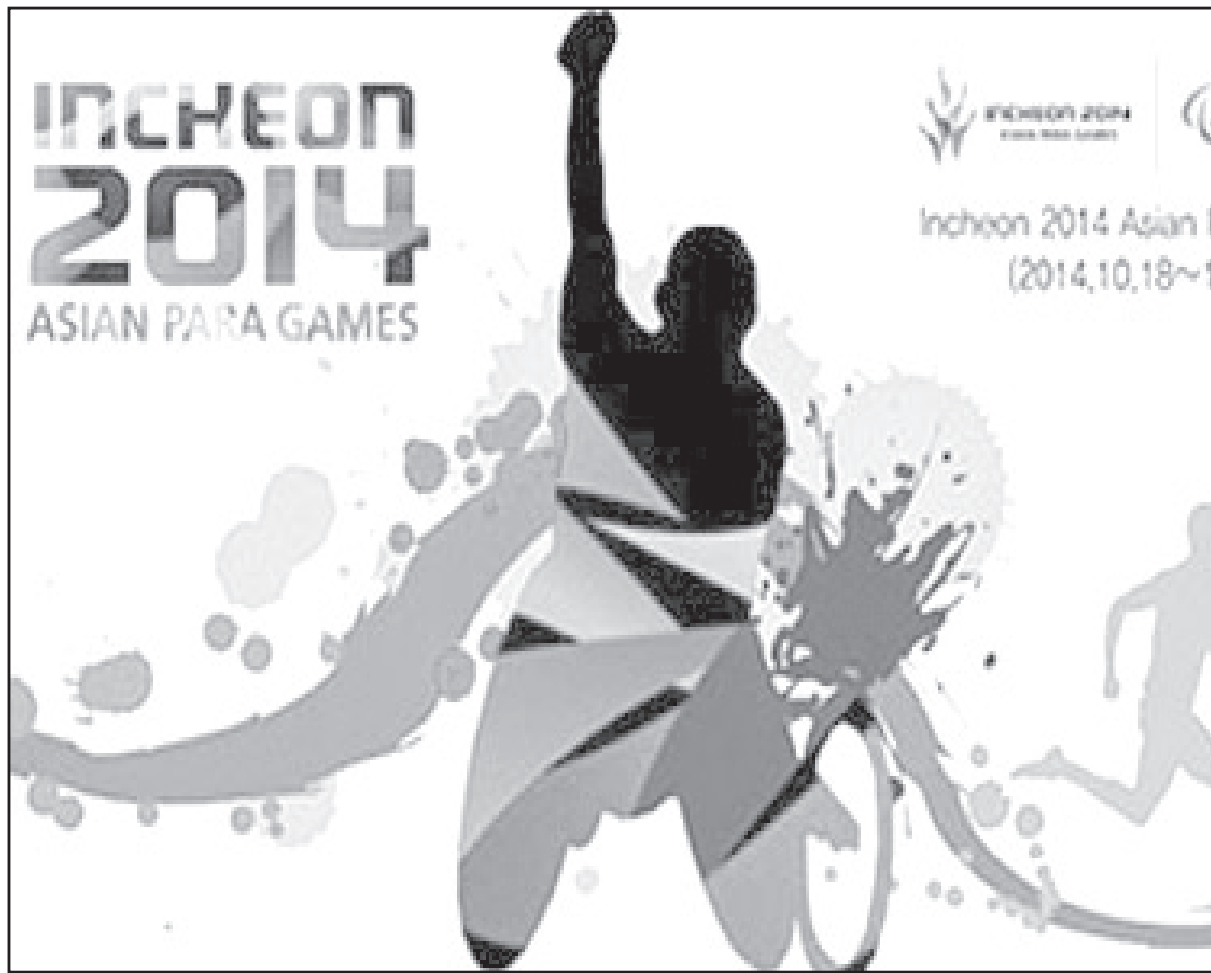
Incheon Para Asiad poster

INCHEON (Press TV) - Iran has bagged 19 medals, including five gold's in the first day of 2014 Asian Para Games in South Korea's Incheon.