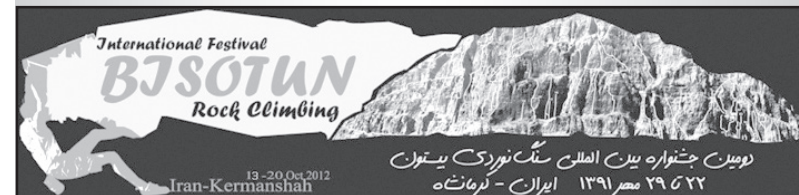
Bisotoun Rock Climbing Festival logo

KERMANSHAH (IRNA) -- The 3rd Bisotoun Rock Climbing Festival in neighboring mountains of Iran's archeological Bisotoun City began on Sunday evening.