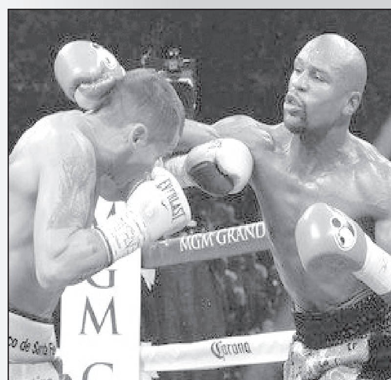
Floyd Mayweather takes another shot at Manny Pacquiao

Still, there's more reason to be pessimistic than optimistic. The two camps couldn't make this fight happen in 2010, when both fighters were at the peak of their powers and the money involved would have been off the charts. The bad blood hasn't cooled. In 2012 Arum accused Floyd of turning down $100 million to fight Pacquiao, and said the fight would never happen. As recently as Sep-