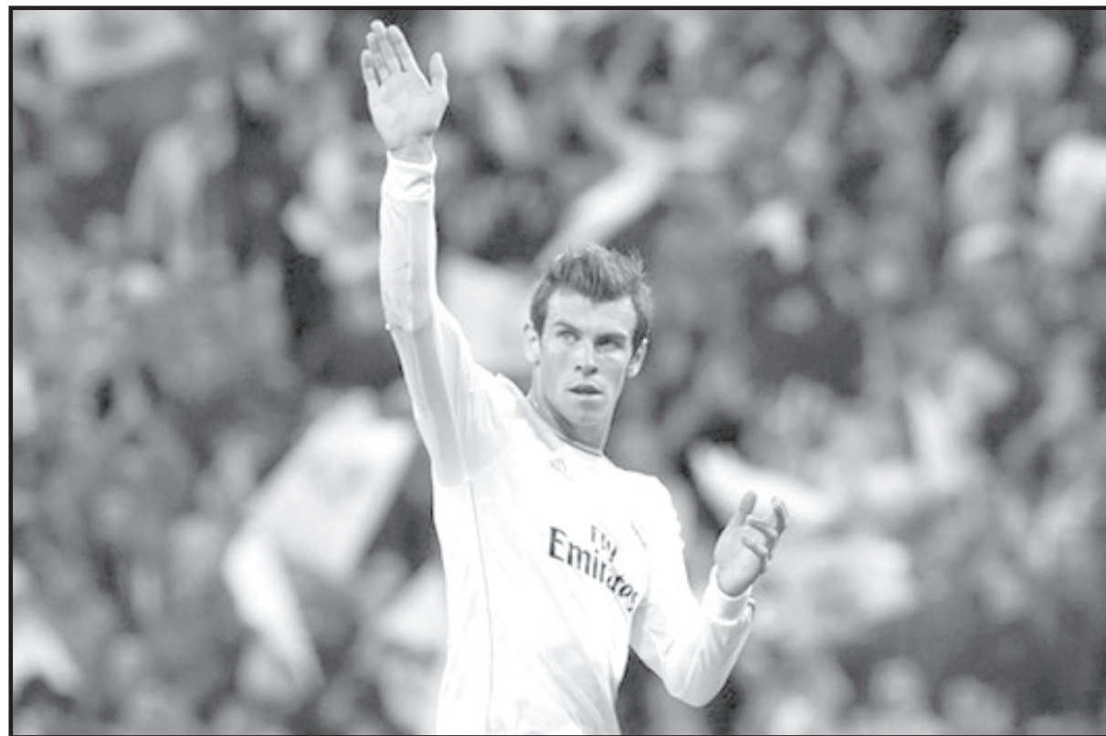
TEHRAN (FNA) - Manchester United will attempt to sign former

Tottenham star Gareth Bale in a world-record transfer at the end of