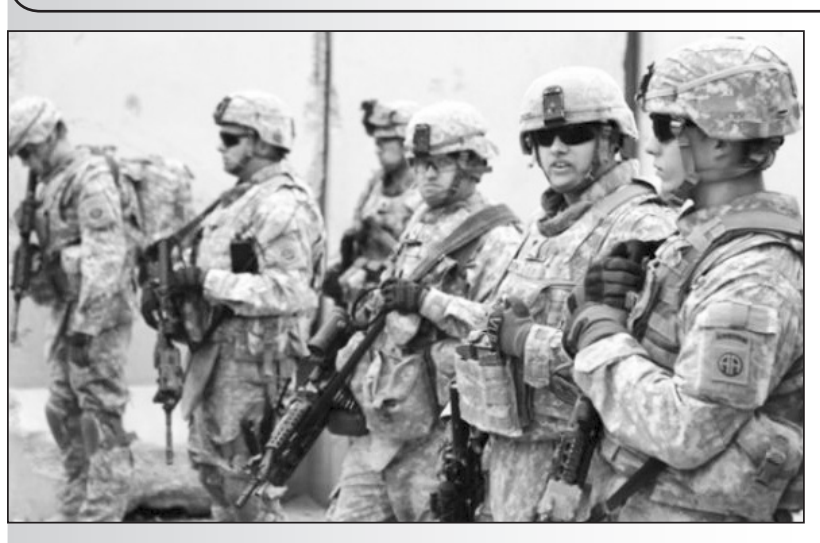
US soldiers wait for the end of a Detainee Release Ceremony in which 38 detainees were released back into the population in the town of Baharia, Al Anbar Province, Iraq.

The Pentagon on Friday said Amer- costing an average of $7.5 million