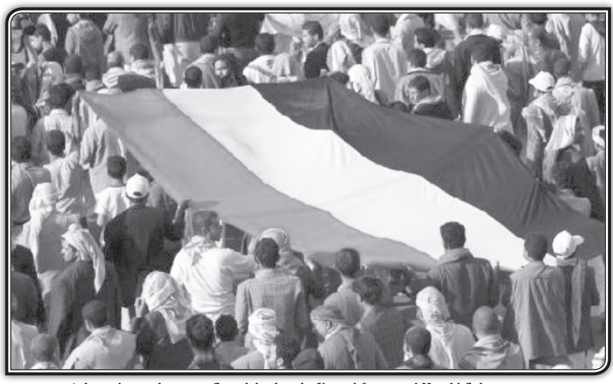
At least six people are confirmed dead as the Yemeni forces and Houthi fighters engage in a fresh series of violent clashes in Yemen's capital.

SANAA (Press TV) – At least six people are confirmed dead as the Yemeni forces and Houthi fighters engage in a fresh series of violent clashes in Yemen's capital, Sana'a.