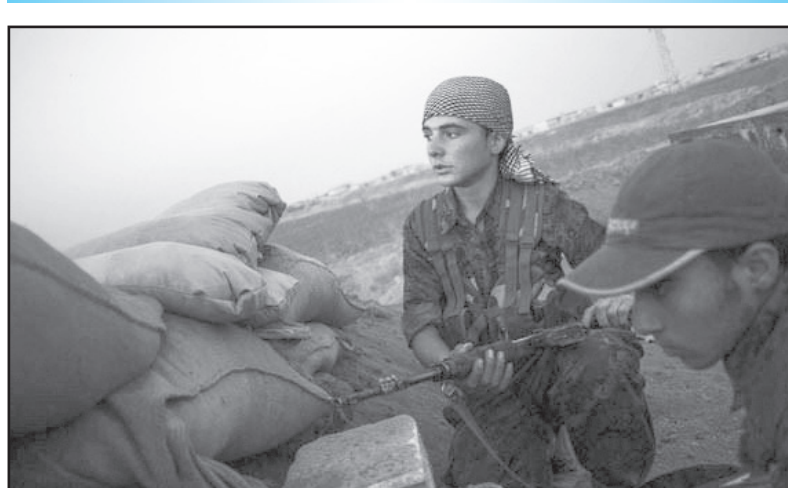
Fighters of the Syrian Kurdish People's Protection Units (YPG) take position behind sand bags inside the Syrian town of Ras al-Ain.

ANKARA (Dispatches) – Over 300 Kurdish fighters have crossed into Syria from Turkey to battle the Takfiri ISIL terrorists operating inside the Arab country.