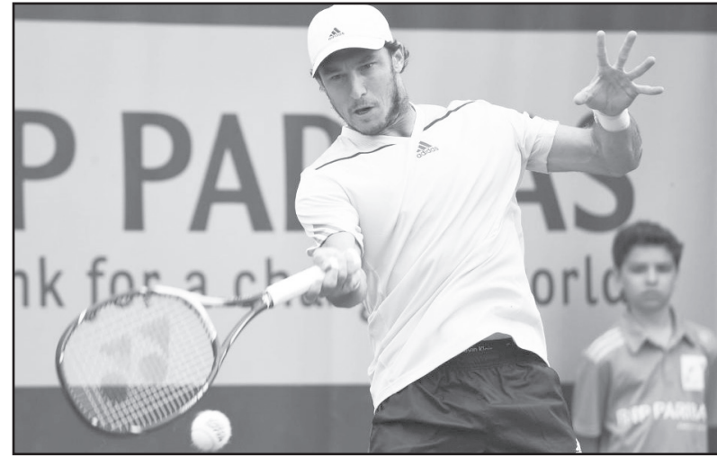
Argentina's Juan Monaco

GSTAAD (AFP) - Argentine Juan Monaco claimed a place in his first final in almost a year on Saturday as he defeated Robin Haase 6-3, 7-6 (7/4) at the Swiss Open, setting up a showdown with Spain's Pablo Andujar.