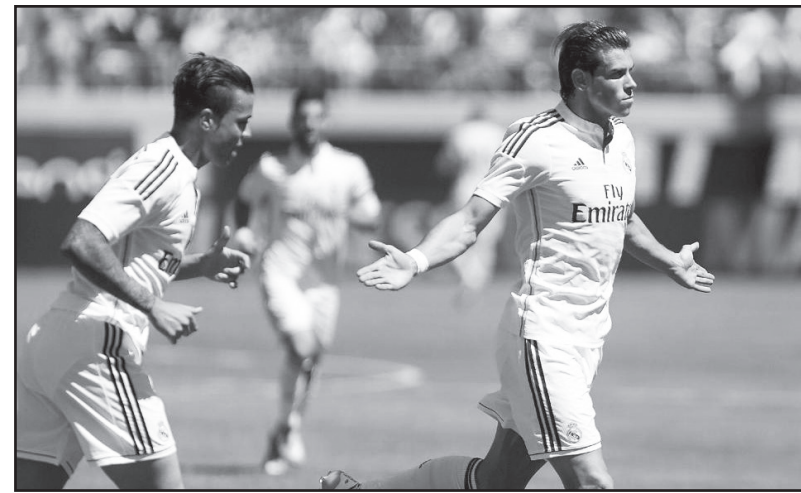
Real Madrid's Gareth Bale, right, celebrates after scoring a goal against Inter Milan in the first round of the Guinness International Champions Cup.

The eight-club Guinness International Champions Cup will continue at various stadiums throughout North America until Aug. 4