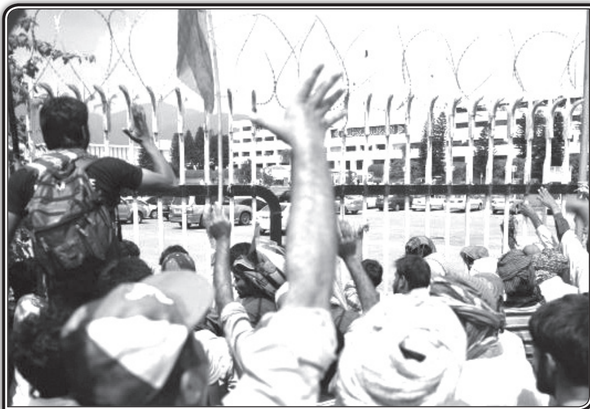
Pakistani supporters of cleric Tahir-ul-Qadri gather in front of the parliament during a protest in Islamabad on August 20, 2014.

ISLAMABAD (Press TV) - Tens of thousands of Pakistani protesters have marched on the country's parliament in the capital Islamabad amid tight security.