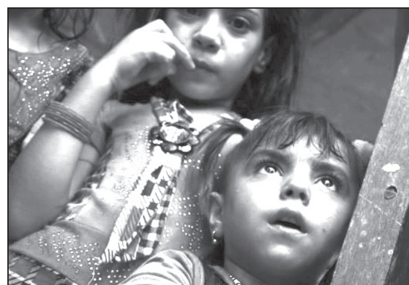
Displaced Iraqi children at a mosque west of the southern Iraqi city of Basra, August 19, 2014