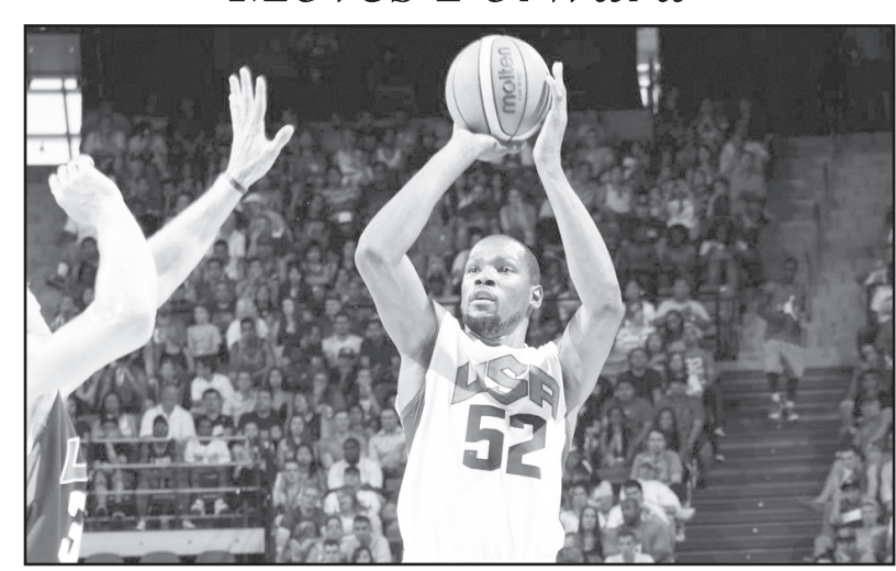
Kevin Durant #52 of the USA White Team shoots during the USA Basketball Showcase.

NEW YORK (AP) - While Kevin Durant takes a step back, the U.S. national team is moving forward.