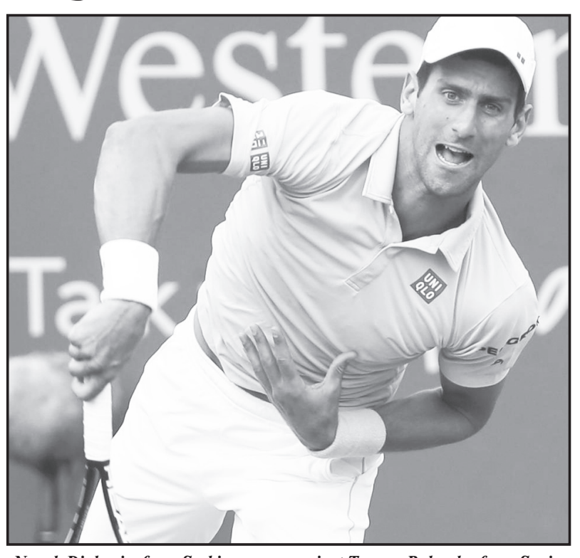
Novak Djokovic, from Serbia, serves against Tommy Robredo, from Spain.

NEW YORK (AFP) - Top-ranked Novak Djokovic is seeded No. 1 for the U.S. Open, and five-time champion Roger Federer is No. 2, meaning they could meet only in the final.