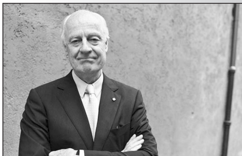
UN Special Envoy Staffan de Mistura

UN Secretary General appointed de Mistura as the UN Special Envoy for Syria on July 10th after the resignation of former envoy Lakhdar Brahimi last May.