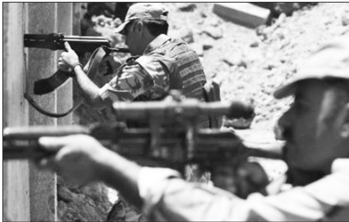
Iraq has announced purging the area of Haraniya Bridge from the terrorists of the so-called Islamic State of Iraq and the Levant in Diyala province.