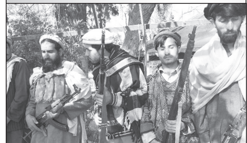
The file photo shows Taliban members in Afghanistan.

KABUL (Press TV) – The Taliban militants in Afghanistan have rejected recent reports suggesting that they agreed to hold preliminary peace talks with the government in Kabul.