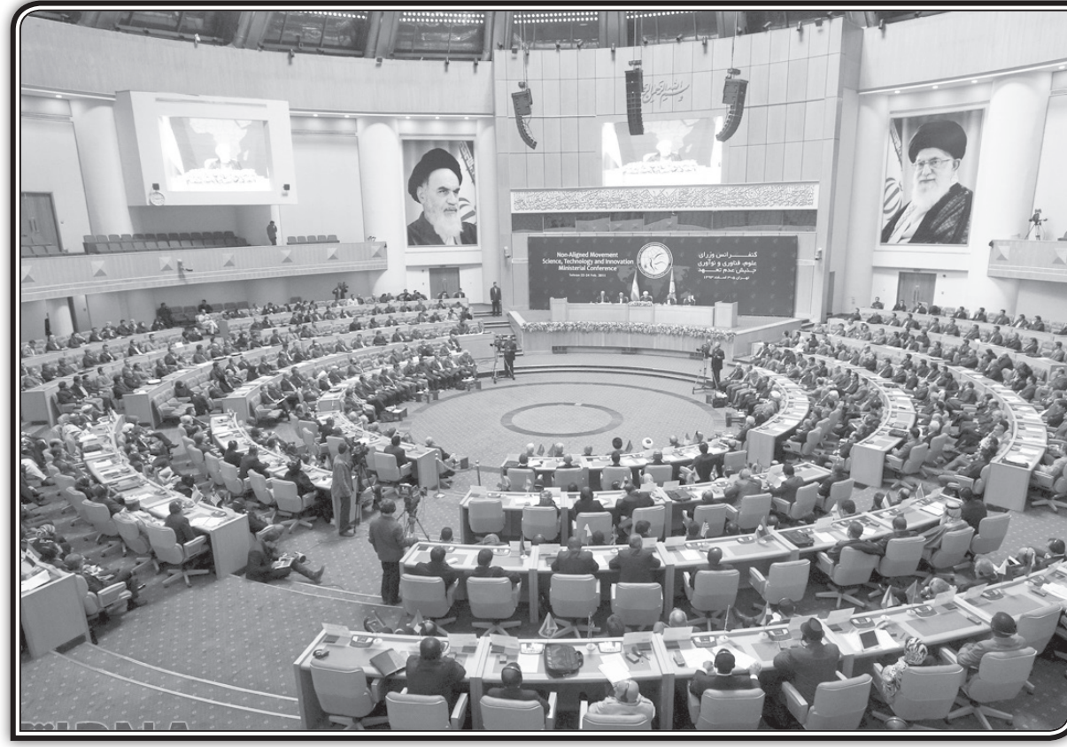
President Rouhani addresses a meeting of NAM science ministers in Tehran.

TEHRAN (Dispatches) -- President Hassan Rouhani said here on Monday that sanctions imposed by some world powers hamper scientific progress, describing it as "modern hegemony".