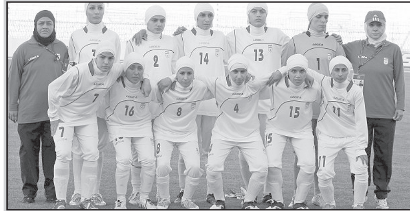
Iran female football players depart for Taiwan

TEHRAN (MNA) – Iran women's national football team headed to Taiwan to participate in qualifying games of Rio 2016 Olympics.