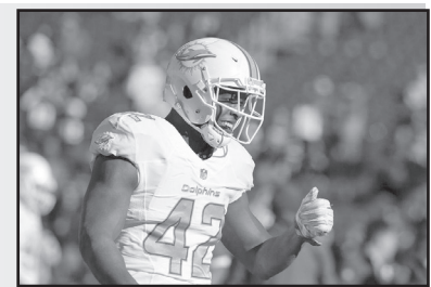
Miami Dolphins tight end Charles Clay (42) warms up on the field before an NFL football game against the New England Patriots.

The Dolphins could be handcuffed by salary-cap constraints to match the Bills' offer after Miami signed free-agent All-Pro defensive tackle Ndamukong Suh to a $114 million, six-year contract last week. It made Suh the highest-paid defensive player in NFL history.