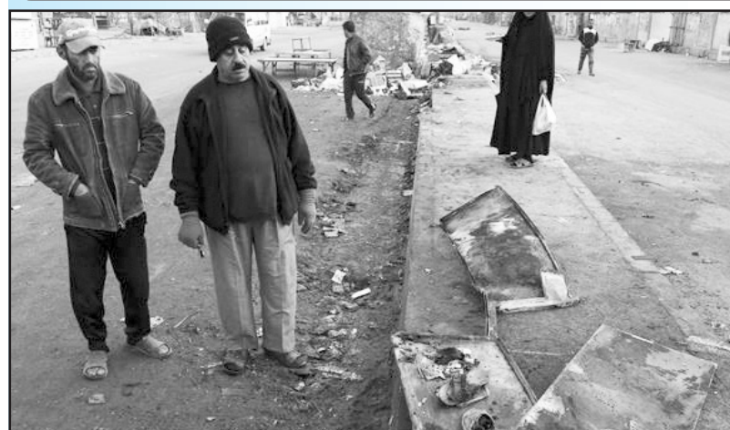
Iraqis inspect the site of a bomb explosion in Baghdad's district of Sadr City.

BAGHDAD (Dispatches) – A string of deadly explosions has rocked areas in and around the Iraqi capital, Baghdad, leaving