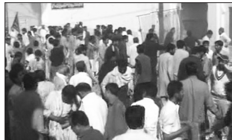
People gather at the site of blast in Shikarpur.

ISLAMABAD (Press TV) – Latest reports say about 50 people have been killed and dozens injured in a bomb attack on a Shia mosque and religious center in Pakistan's southern province of Sindh.