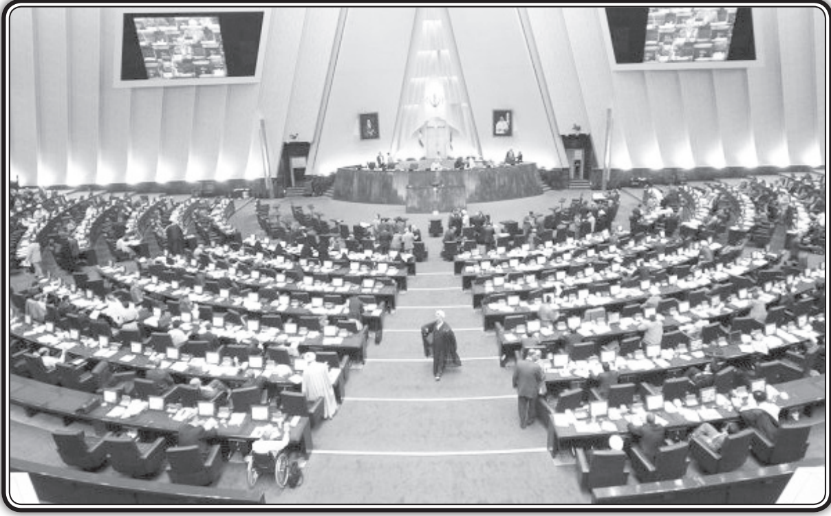
This file photo shows Iran's parliament in session.

TEHRAN (Press TV) -- The first vice speaker of the Iranian parliament (Majlis) has warned that Tehran will scale up its nuclear program should Capitol Hill impose further sanctions against the Islamic Republic over its civilian atomic work.