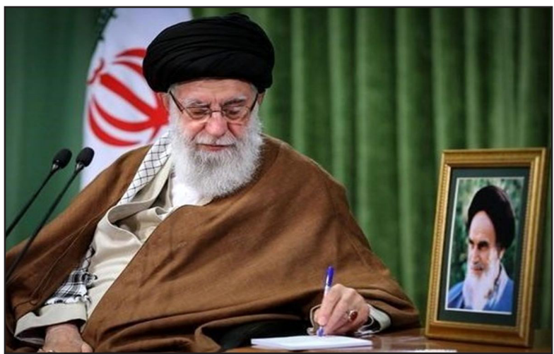
TEHRAN - Leader of the Islamic Revolution Ayatollah Seyyed Ali Khamenei has extended a mes-

sage of congratulation to Iran's national Greco-Roman and freestyle wrestling teams for clinching Asian