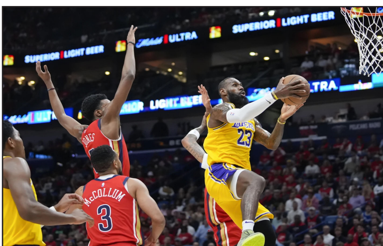
Los Angeles Lakers forward LeBron James (23) goes to the basket in the first half of an NBA basketball play-in tournament game against the New Orleans Pelicans, Tuesday, April 16, 2024, in New Orleans.

— in his second game back from a 12-game absence because of a knee injury — missed 8 of 12 shots and finished with 11 points after spending the final few minutes on the