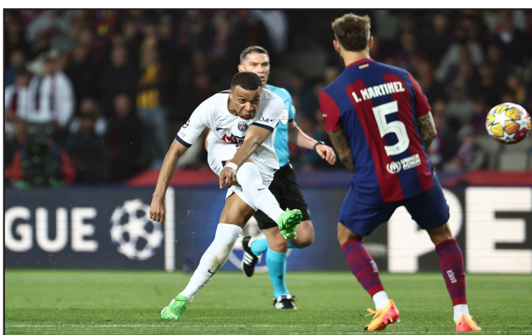
Paris Saint-Germain's French forward #07 Kylian Mbappe kicks the ball during the UEFA Champions League quarter-final second leg football match between FC Barcelona and Paris SG at the Estadi Olimpic Lluis Companys in Barcelona on April 16, 2024.

Having failed to get past the round of 16 in the last two seasons and being pinned against the ropes by a Barca side who were in the ascendancy, PSG