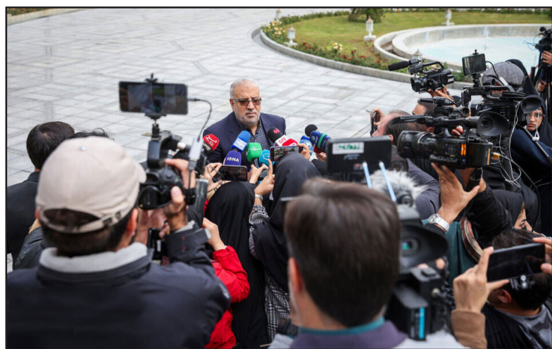
Iranian Petroleum Minister Javad Owji talks with reporters after a cabinet meeting.

TEHRAN – Iranian Petroleum Minister Javad Owji said Wednesday that Iran recorded a 20% increase in oil and gas production last year of 1402 (March 21, 2023-2024) in the Iranian calendar, predicting a higher production this year.